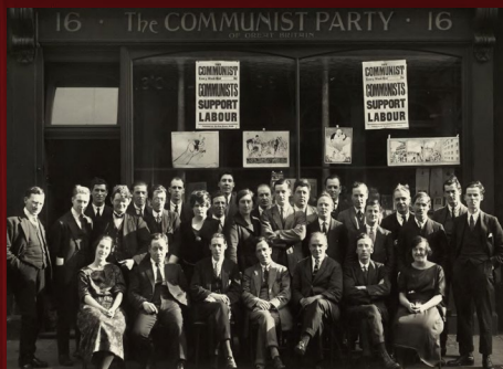
This collection is one of many CPGB resources hosted on the British Online Archives website.

British Online Archives updated collection, Radical Trade Unionism in Britain, 1921-1991 is drawn from the Communist Party of Great Britain's (CPGB) Industrial Department and offers a look at 70 tumultuous years of trade union history in Britain.