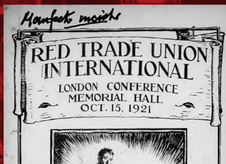
Material from the Red International of Labour Unions shows how the Soviet Union sought to control the international trade union movement.

The material, including correspondence, reports, and pamphlets, follows the CPGB's attempts to support, radicalise, and infiltrate British trade unions. This includes files from the revolutionary National Minority Movement (NMM) of the 1920s, which played a key role in the failed General Strike of 1926, to the bitter disputes between Thatcher's government and the National Union of Mineworkers (NUM) during the upheaval of the 1980s