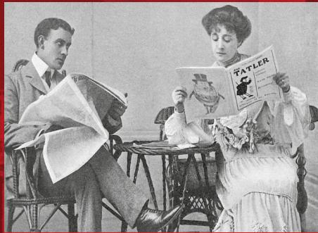
Until 1968, The Tatler was owned by the Illustrated London News (ILN).

Appearing on a weekly basis, and enduring two World Wars, this magazine kept its readership abreast of the latest developments in British High Society.