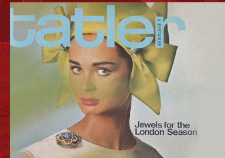
Its coverage was highly eclectic, not only reporting on the latest debutante balls and engagements, but also classical music, Russian ballet, and 1960s thrillers.

Sources include: Illustrated London News