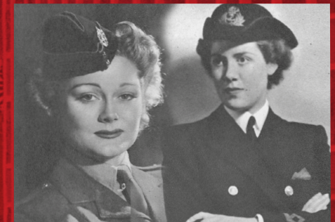
Contributors include celebrated theatre critic James Agate and artist Henry Mayo Bateman, one of the most acclaimed caricaturists of the 1920s and 1930s.

Over 4 million records covering 1000 years of world history: from politics & warfare, to slavery & revolution.