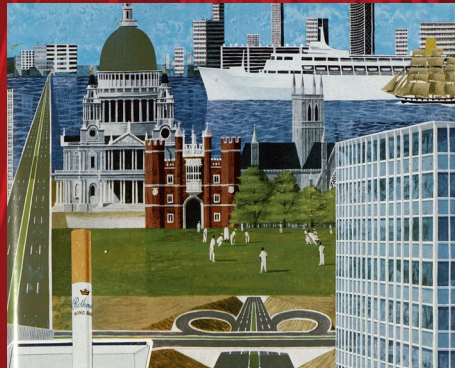
This collection contains over 250,000 images from more than 3,000 issues of The Tatler .

Focusing mainly on fashion, theatre, and sports (especially cricket and golf), The Tatler provided regular glimpses into the lives of the rich and famous, habitually regaling readers with news and gossip about Britain's most prominent socialites, including aristocrats, athletes, and actors.