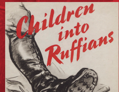
Items include anti-Nazi posters and publications from the Second World War.

Over 4 million records covering 1000 years of world history: from politics & warfare, to slavery & revolution.