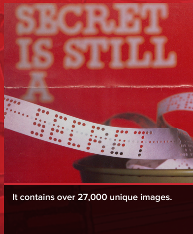
It contains over 27,000 unique images.

The items in this collection are diverse in nature, ranging from posters and stickers to pamphlets and guidance booklets.