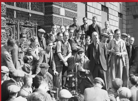
The collection is part of the wide-ranging British Communism, At Home and Abroad series.

The pair alleged that members of the Communist Party of Great Britain (CPGB) had engaged in “a conspiracy to defraud” in the 1959 elections of the Electrical Trades Union (ETU), a relatively successful body that represented electricians, wire fitters, and telephone engineers.