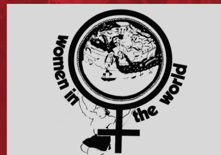
Campaigns on abortion rights, employment law, and disarmament are all covered in detail, as is the sexual revolution.

Over 4 million records covering 1000 years of world history: from politics & warfare, to slavery & revolution.