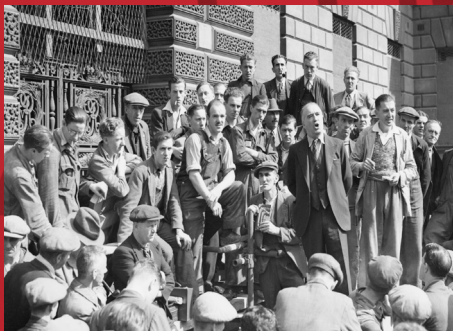
The collection is part of the wide-ranging British Communism, At Home and Abroad series.

These records include minutes, agendas, and promotional materials from various women's campaigns, events, and conferences.