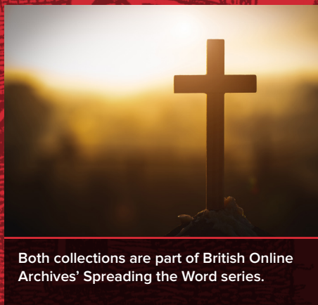
Both collections are part of British Online Archives' Spreading the Word series.

Founded in 1861 with the mission 'to tell truth and love', the Methodist Recorder emerged as a more liberal rival to the first Methodist newspaper, The Watchman , which it later incorporated.