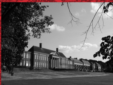
They were sourced from the Oxford Centre for Methodism and Church History.

Despite a declining number of practising Methodists, The Recorder is still in print today.