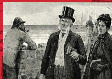
Research: Provides students and researchers with an opportunity to study debates between different denominations of Methodism.